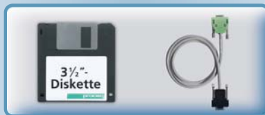
EQUOLINK 2 Software and Transfer cable 9/9-pole Art.No. 350 00 350

Memory Transfer (WINDOWS 3.1x, 95 NT 3.51)