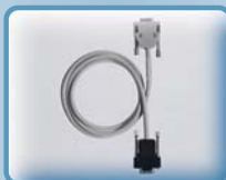
Printer cable 9/9-pole Art.No. 350 74 994