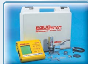
Standard Unit Art.No. 350 00 105