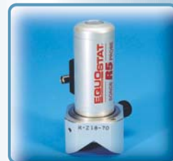
Special foot R-Z 18-70 Art.No. 350 00 210