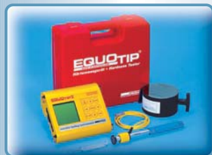
Unit G Art.No. 350 92 000