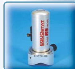
Special foot R-Z 70-00 Art.No. 350 00 211

PROCEQ SA Riesbachstrasse 57 CH-8034 Zürich Switzerland