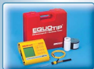
Unit E Art.No. 350 93 000