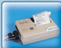
Mini printer incl. AC adapter Art.No. 350 74 995 (110 V) Art.No. 350 74 999 (220 V)