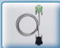
Transfer cable 9/9-pole Art.No. 330 00 456

Output of measures data after each measure serie