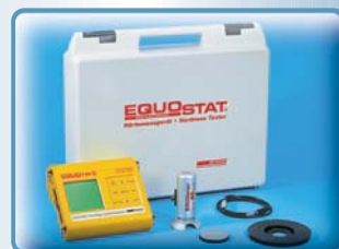
Unit R-H for free hand measurement Art.No. 350 00 106